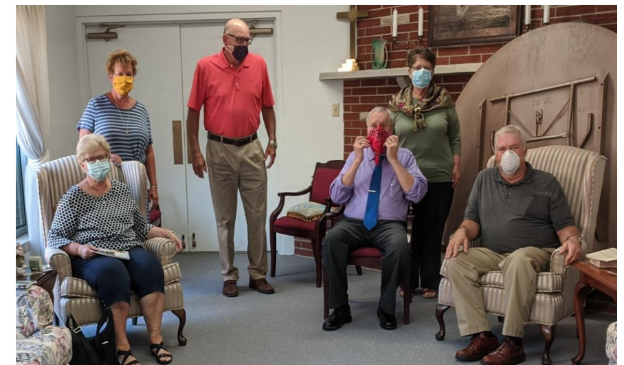
Becomers Sunday School Class